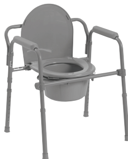
Raised toilet seat - fits over toilet