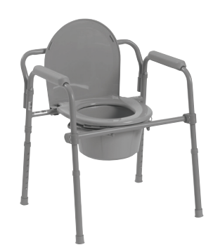
Raised toilet seat - fits over toilet